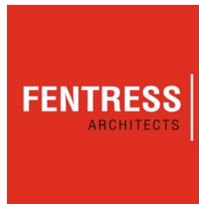
Fentress Bradburn Architects, Ltd. http://www.fentressarchitects.com/