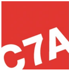
Cambridge Seven Associates, Inc. http://www.c7a.com/