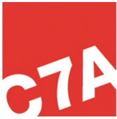
Cambridge Seven Associates, Inc. http://www.c7a.com/